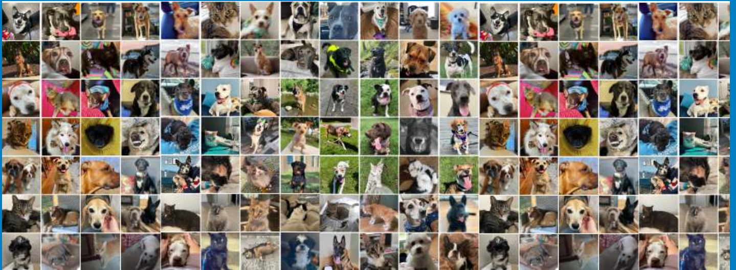
2024 Companions in Crisis grant recipients